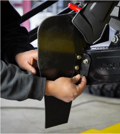
Figure 3A: Guard Orientation