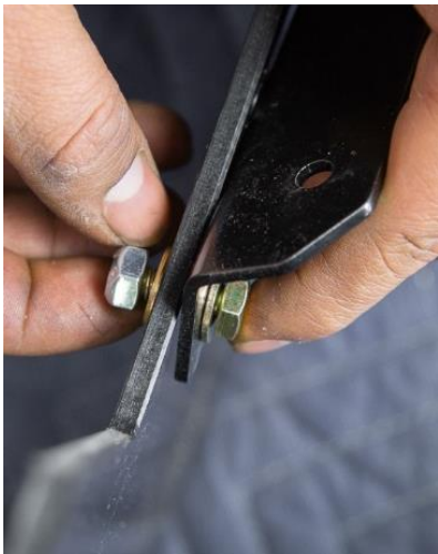
Figure 2A: Bracket Orientation