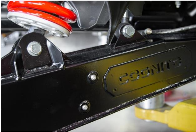
Figure 1A: Mounting Location