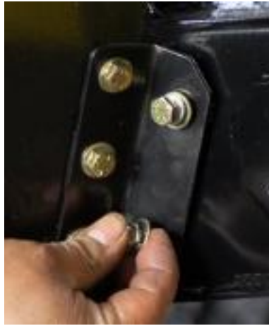
Figure 3B: Bolt Orientation